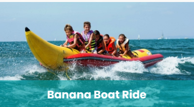
Banana Boat Ride